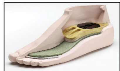
Impulse foot

Foot-ankle systems for these levels now reflect many of the design advantages previously developed for the very active, high-impact level 4 patient. Steady improvements in weight reduction and reliability have brought K3-K4 components within the realm of moderately active amputees. For example, light-