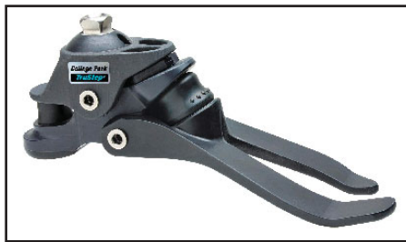
TruStep advanced foot