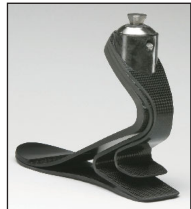
Renegade foot

Multiaxial ankle/foot systems are particularly appreciated by amputees who enjoy outdoor activities, notably hikers and golfers. They also lend themselves well to the needs of bilateral amputees. These patients frequently benefit from a dynamic response foot built around a flexible keel, which deforms during weight-bearing, storing energy, then releases that energy during late-stance phase, providing forward propulsion.