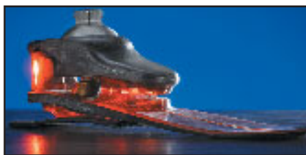
LuXon Journey high performance foot