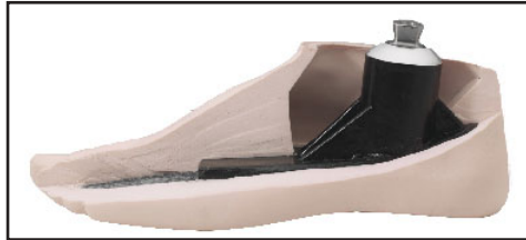
Single-axis foot

The single-axis foot incorporates the enhancement of an ankle component. This mechanism allows the forefoot to move downward through forward action at the ankle, rather than through initial heel strike. Movements are modulated by plantar flexion and dorsiflexion bumpers. This is also a low-cost, lightweight option, though somewhat more expensive than SACH models.