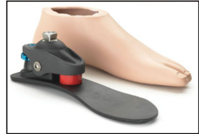
Tribute foot incorporates multiaxial ankle.

• Freedom Innovations, a new manufacturer on the scene, offers two innovative feet in its Revolution series: the Runway, featuring a user-adjustable heel height, and the Renegade, an extremely lightweight foot with built-in shock-absorbing qualities.