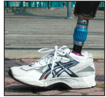
DuraShock Pylon

Other notable designs in this category include Otto Bock's Delta Twist Shock Absorber, which features independently adjustable rotation settings for heel strike and toe off, and Össur's Total Shock.