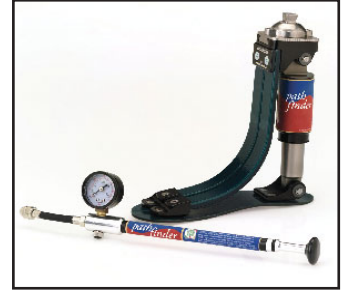
Pathfinder system.