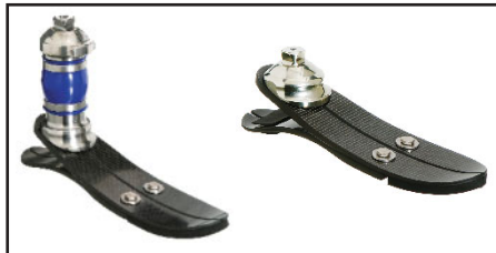
Ceterus (left) and Vari-Flex feet