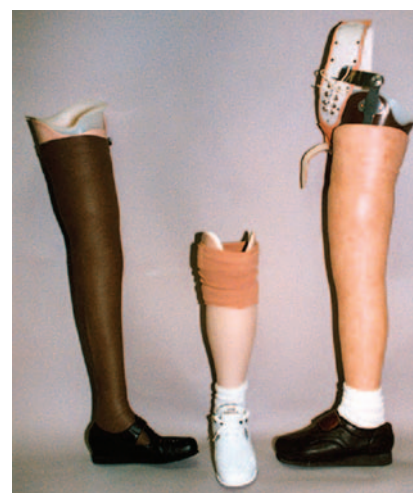
Prosthetic sleeves come in a variety of sizes colors and enhancements, such as the appearance of hair (at right).

The type and degree of cosmesis applied to a prosthetic limb are determined by several factors, including the desires, vocation and lifestyle of the amputee, cost and reimbursement resources, and the