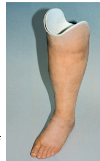
Finished prosthesis with detailed cosmesis applied