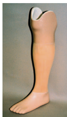
Endoskeletal form cover ready for finishing

• Detailing. Beyond the basic cosmetic treatment for a prosthetic limb—general shaping and pigmentation to match the residual limb—