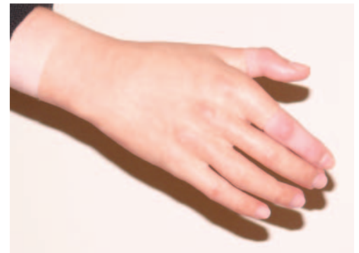
Glove close-up shows immaculate detail.