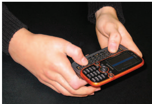
Cody demonstrates his preferred texting technique.

Although it is possible to text using the one finger "hunt and peck," today's accomplished practitioners of the art prefer the "flying thumbs" method of text