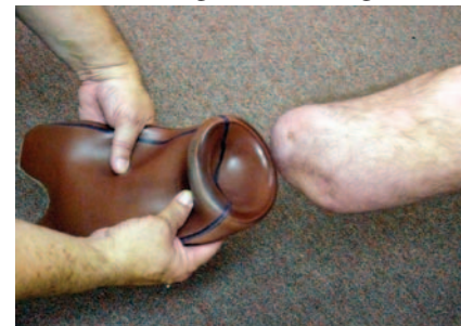
Demonstrating correct technique for donning Kyle's custom gel liner.

safety. After ensuring the socket fit properly and testing the suspension, Kyle's prosthetist evaluated the static alignment, noting the length and angulation of the prosthesis as Kyle stood upright and relaxed. Next came dynamic alignment involving careful analysis of Kyle's gait and making adjustments to optimize function, maximize comfort and minimize energy expenditure.