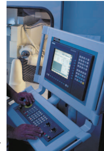
CAD/CAM carver brings digital precision to forming socket molds.

Starting with information from a direct scan or negative cast of the residual limb, CAD/CAM software presents a visual image of the limb from which the prosthetist can design a socket on a monitor, optimizing the overall shape and trimlines and adding build-ups and reliefs as necessary. Finally, the CAD/CAM system feeds the design to a carver, which that creates a positive model over which the shell of the definitive socket can be vacuum-formed.