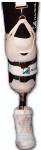
AOPPS post-op system

Welcome to the Autumn 2009 issue of First Step , a professional publication of Gulf Coast Orthotics and Prosthetics. Through this quarterly newsletter, we endeavor to keep the Pensacola rehabilitation community abreast of the latest trends, developments and technology in the orthotic and prosthetic management of physically challenged patients.