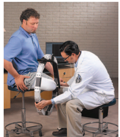
CAD/CAM scanning systems such as the Omega TracerCAD create a precise digital model of the residual limb for socket fabrication.