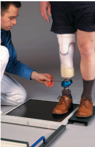
LASAR Posture alignment system.

“Fit” refers to the quality of the interface between the socket and residual limb. “Alignment” is the important relationship of the socket, ankle and foot in a below-knee prosthesis (adding the knee for an above-knee limb). Because a unilateral lower-limb amputee expends an estimated 40 percent more energy walking than a person without limb loss, it is essential that the limb function with optimal efficiency.