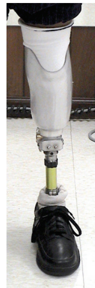
Check sockets enable prosthetists to view residual limb in "working" environment.

Patients normally wear their preparatory prosthesis for 3-6 months. During this period, prosthetist and therapist can interact to help the amputee adjust to his or her maturing residual limb and other physical changes. Several fit and alignment adjustments are normally made during this period as residual limb edema subsides and the patient's gait becomes more efficient.