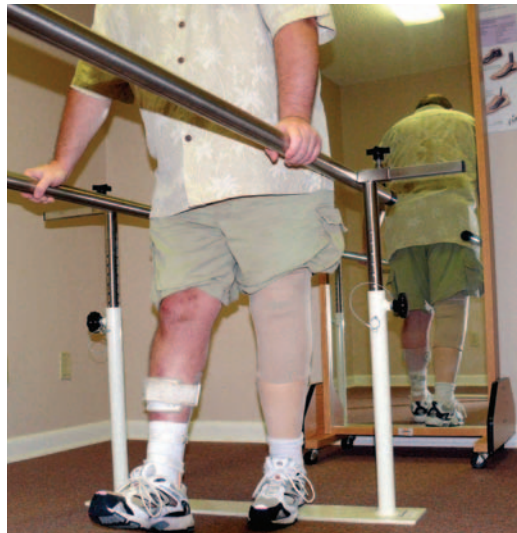
Gait training—Key ingredient for regaining ambulatory mobility.

Between these extremes the custom removable rigid dressing and prefabricated options such as the APOPPS (Adjustable Post-Operative Protective & Preparatory System) offer compromise solutions that enable both wound inspection and reasonably early weight-bearing. Even if not involved before the amputation, the prosthetist can still initiate early intervention if the referral is made while the patient is still in the hospital. The sooner the prosthetist and therapists working with the new amputee can coordinate their efforts, the better.